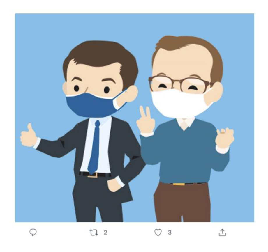
Figure 3. Stimulus for Tweet with GIF Condition.

CDC @ @CDCgov - Jan 20 *** #DYK? Everyone older than 2 should wear a mask in indoor public places if they are: -Not fully vaccinated -Fully vaccinated and in an area with high transmission -Fully vaccinated and with weakened immune systems #MaskUp