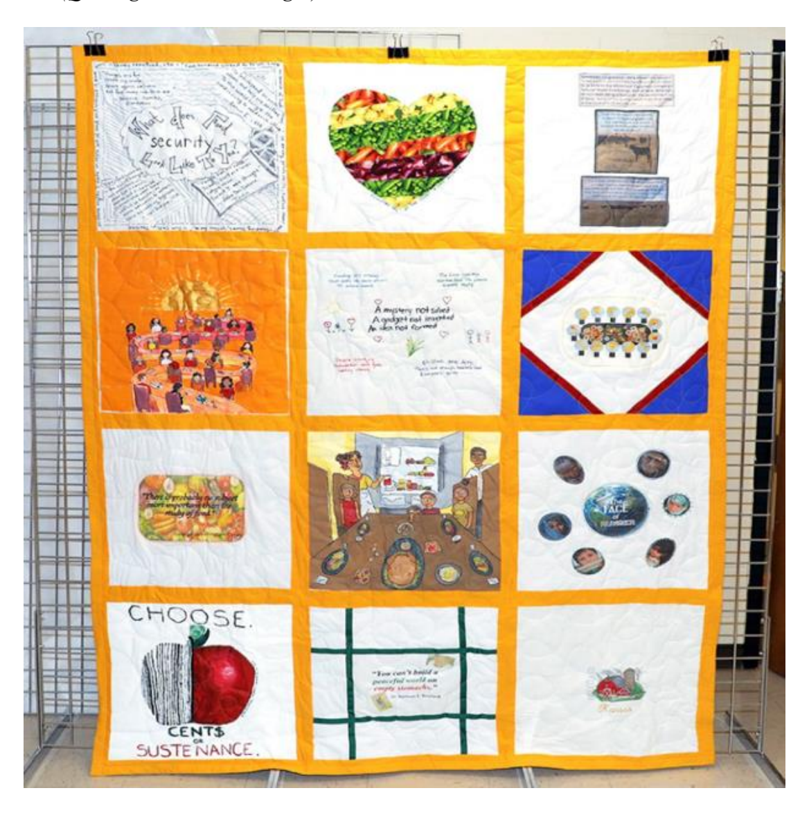
Figure 1 QUITCH (Quilting to Combat Hunger)

To continue to weave this narrative together, I thought it was important to share a community poem that together we wrote with the prompt fighting hunger globally. To do this despite geographical limitations, we engaged with this poem through the Whova app during a GG online conference. Each person commented on the prompt with one line that added to the prompt surrounding hunger, beginning with "Images in my mind..." (see Figure 2). I included