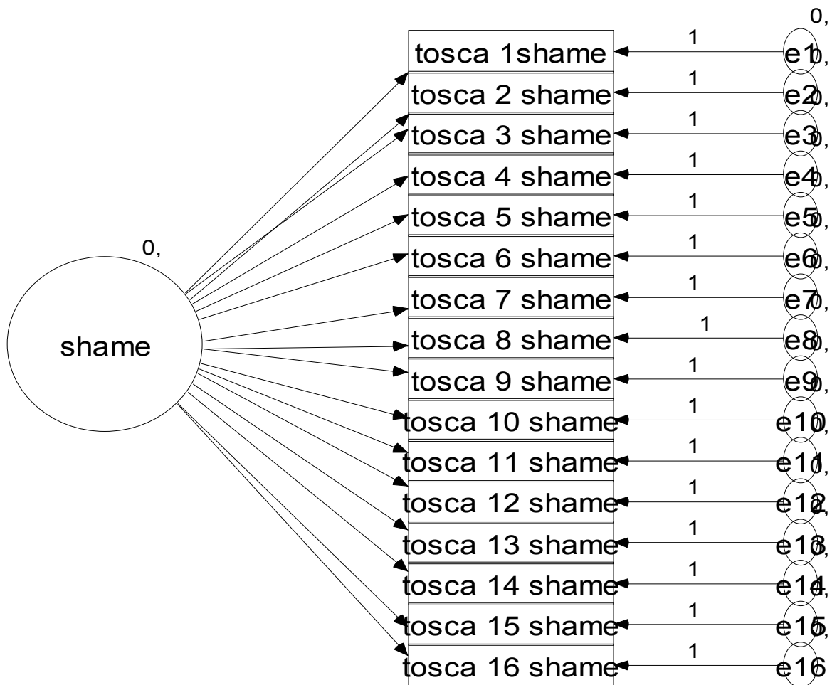
Figure 3 TOSCA 1-FactorShame only CFA Model