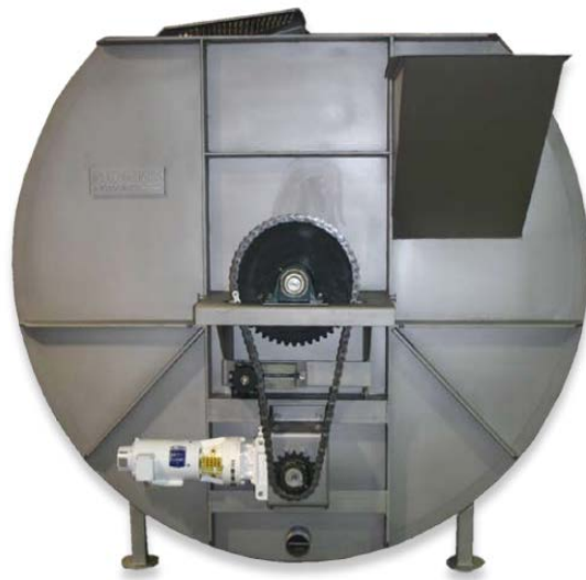
Figure 1. Morris & Associates FinalKill® Finishing Chiller®

Campylobacter recovery. Campylobacter is a very small organism and therefore is more difficult to eliminate since it can get deep into feather tracks and pores in the skin of carcasses. From the pre-chiller and post-chill locations, a mean \log_{10} CFU/mL of 2.3 and 1.5 were recovered, respectively (Berrang and Dickens, 2000). Therefore, utilizing compounds with intervention strategies that can yield a 2- \log_{10} reduction would likely eliminate Campylobacter remaining on the carcass after chilling. Results from an industry survey by McKee (2011) indicated that peracetic acid was the post-chill antimicrobial intervention used by the majority of processors surveyed. It was followed by chlorine, CPC, acids with a pH of 2, and ASC which was used by less than 10% of those surveyed.