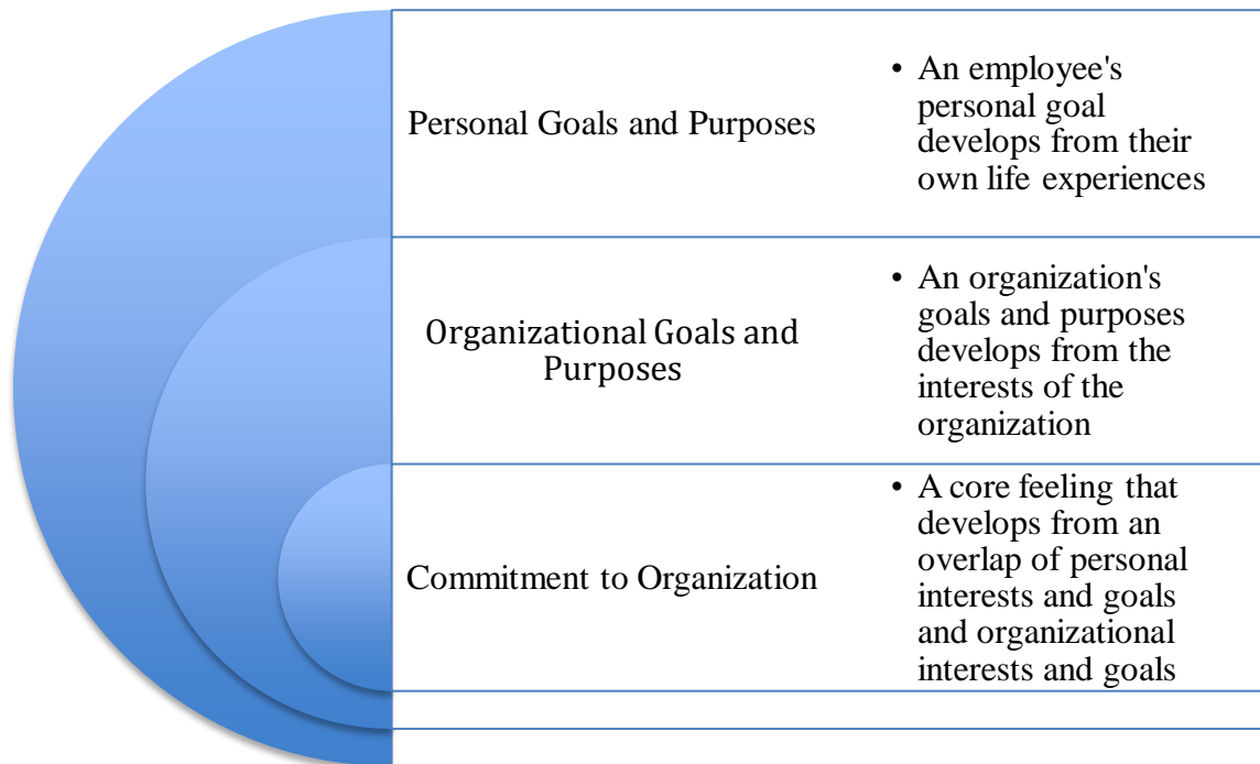
Figure 1: Affective Commitment (Meyer and Allen, 1989)

individual's needs rather than their personal desire. Figure 2 illustrates how continuance commitment increases and decreases in relation to the incentives offered in an organization.