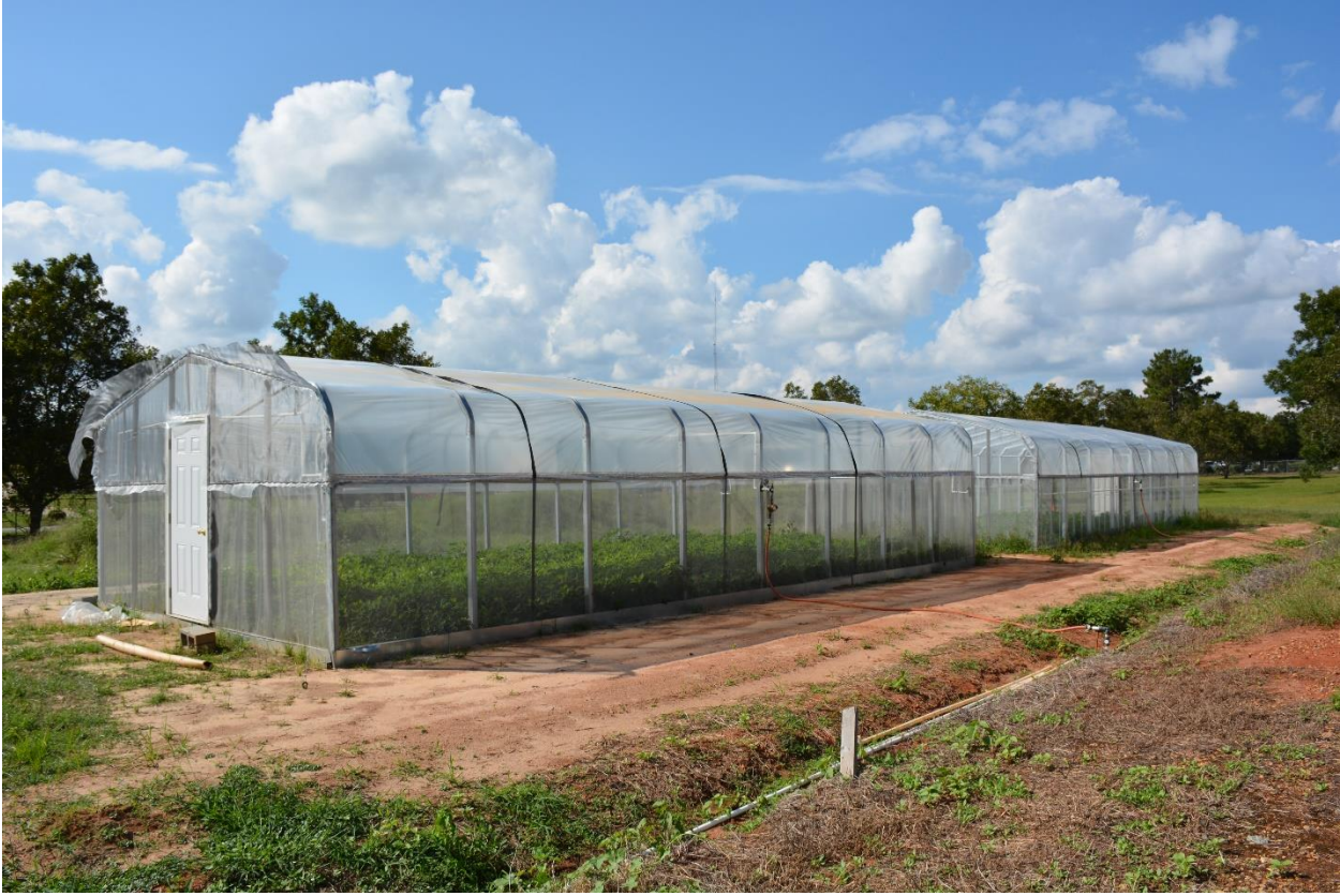
Figure 2; Image of field plastic chamber