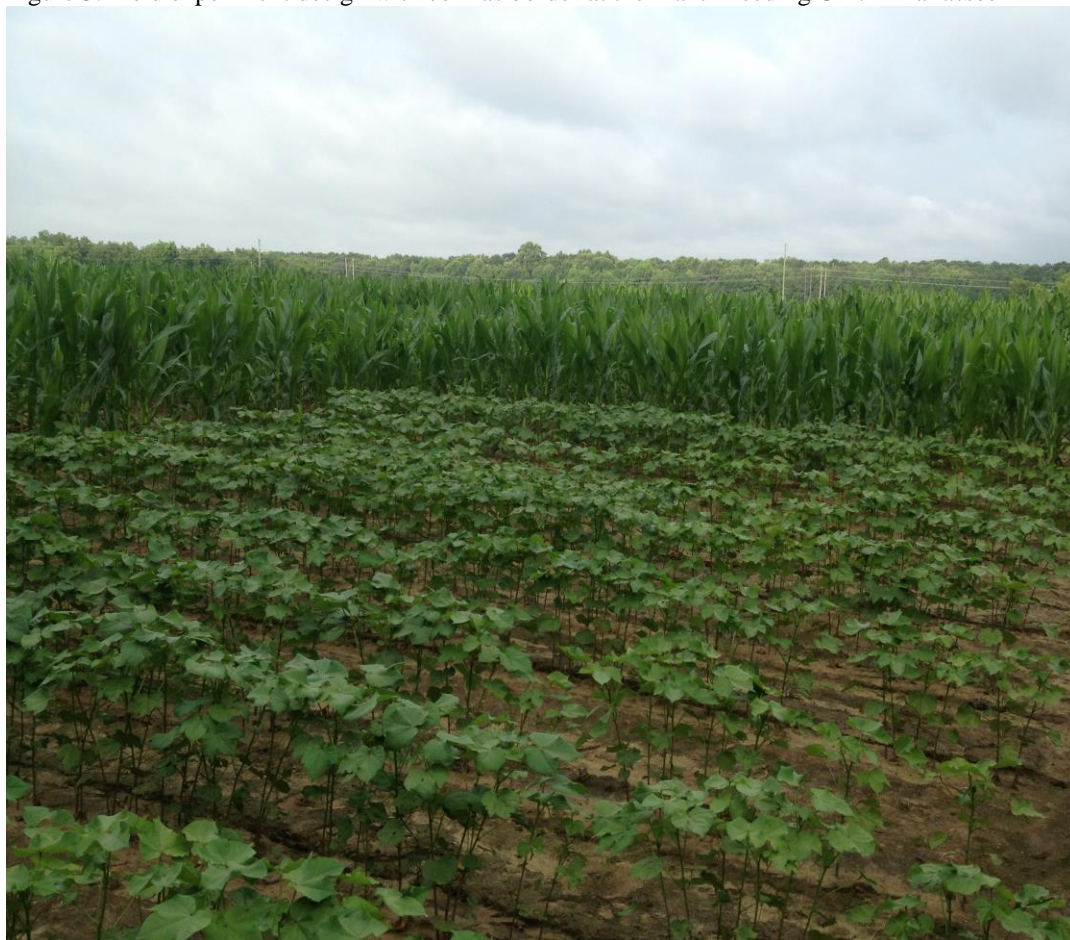
Figure 5. Field experiment design with corn as border at the Plant Breeding Unit in Tallassee