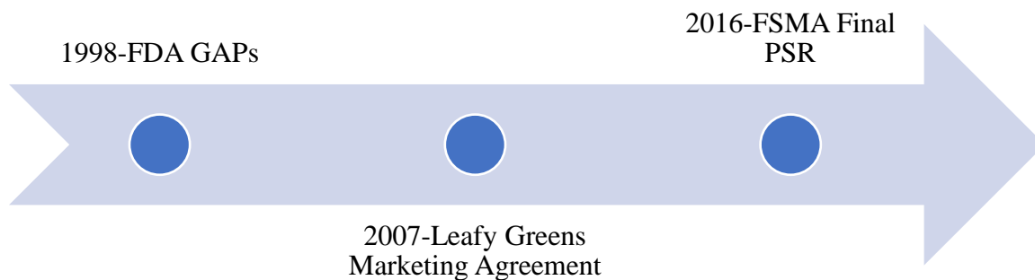
Figure 2.2 Timeline of produce safety regulations.

food safety program following the cantaloupe Listeria outbreak that killed 36 Americans (CDC, 2012; Paggi et al., 2013).