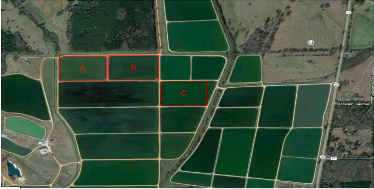
Figure 2.1. Satellite image of the study site showing the locations of the three ponds containing IPRS. (A) Pond R18, location for IPRS Unit 2. (B) Pond R19, location for IPRS Unit 1. (C) Pond R22, location for IPRS Unit 3.