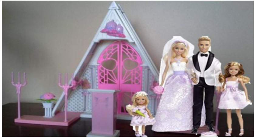
Figure 1: Stimulus representing therapy material